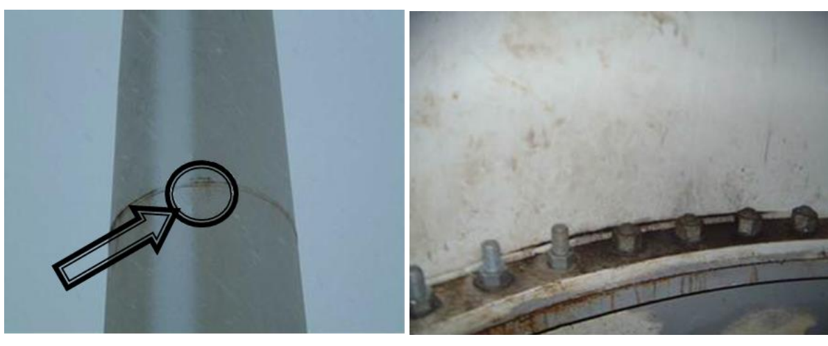
Crack in the weld of the tower

Continuous monitoring of the structural condition of the tower and supporting structure of floating and static offshore wind turbines