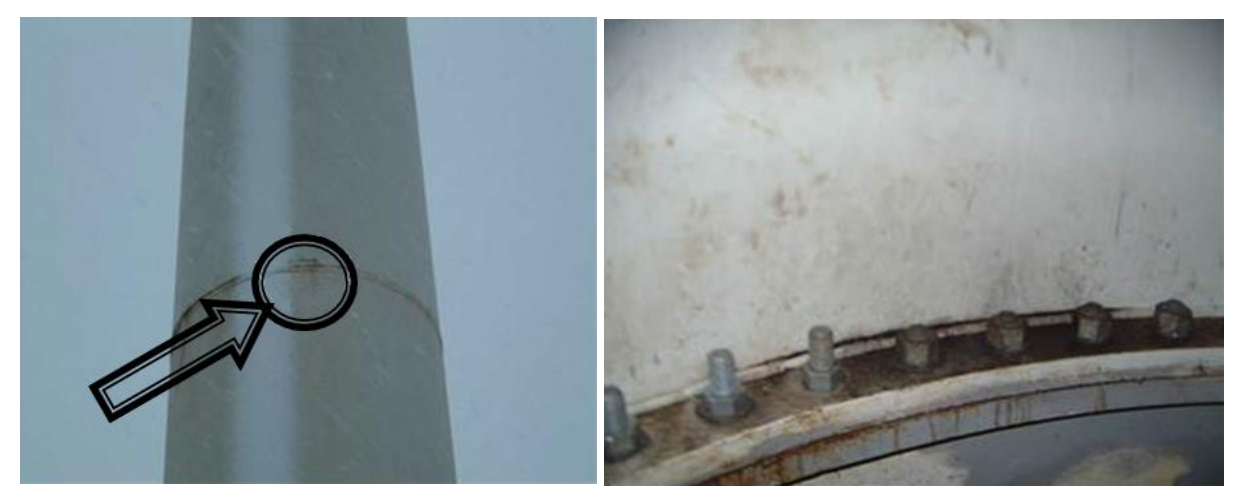
Crack in the weld of the tower

Continuous monitoring of the structural condition of the tower and supporting structure of floating and static offshore wind turbines